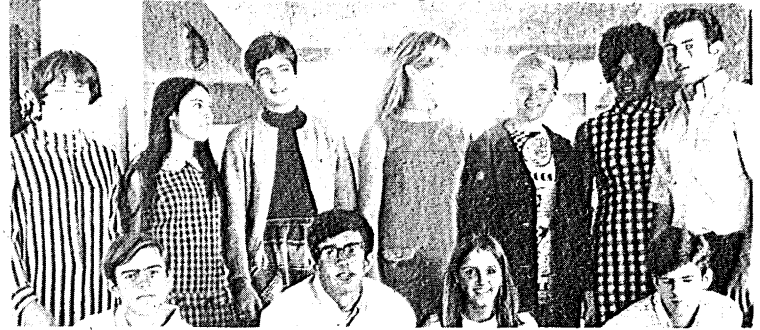
Semifinalists proudly pose for Mirador Photographer.